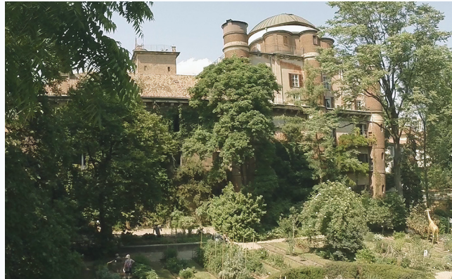
Brera Botanical Garden

The Centre protects and promotes historic buildings and several collections owned by the University , including artistic, librarian, archival, naturalistic and scientific heritage.